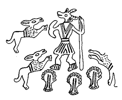
Figure 6 - Terra sigillata stamp from Bronchales, Teruel (after Atrián Jordán 1958: plate XI)

Unfortunately our understanding of these painted designs, particularly the figural ones, is hampered by ignorance of their purpose: were they apotropaic, cultic, or merely ornamental? The choice of one design over another was not accidental, but had a selective value. There is a limited range of motifs, conveying information which could be read by those familiar with the grammar (O'Brien and Holland 1996: 192-3).