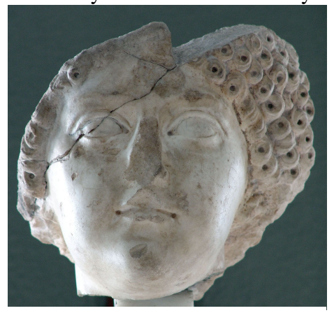
Figure 7 - Marble bust of Julia daughter of Titus.

Meseta artists also mastered the Roman technique of making fine statuary from marble and other stones. Since stone is friable, there are many unidentified heads, torsos and limbs; luckily, we also have many whole examples. Some of these sculptures represent Roman or oriental deities. Others show mythological figures, such as fauns, satyrs, sileni and bacchants. Imperial portrait busts, many of them unearthed in buildings adjoining the forum, assert or affect loyalty to the ruling dynasty (Curchin 1996). These monuments of public art include a young Augustus and young Nero from Clunia , Lucius Caesar and Agrippina Minor from Ercavica , Tiberius from Bilbilis , Agrippina Major and a probable Vespasian from Segobriga , Domitian from Palantia , and a possible Trajan from Valeria . A sardonyx head of Domitian from Turiaso was reworked, after the damnatio memoriae of that emperor, into one of Augustus (Curchin 2004: fig. 3.5). A more unusual subject, again from the forum of Clunia , is Julia Sabina, daughter of the emperor Titus, who became Domitian's mistress and was nominated as consul for 84 (Figure 7). This suggests a familiarity even with relatively minor members of the Imperial dynasty. The