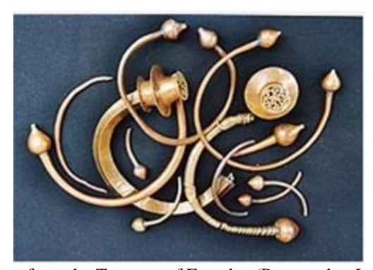
\label{eq:figure of Foundard Poince} Figure~07-Gold~torcs~from~the~Treasure~of~Foxados~(Pontevedra.~Iron~Age).~