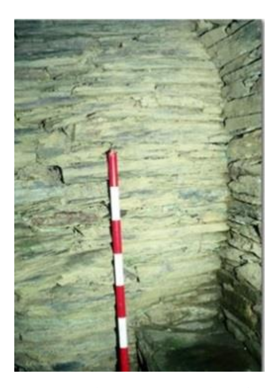
Figure 05 - Sauna of Chao Samartín. In <a href="http://www.castrosdeasturias.es/castros/62/16/la-visita-al-castro">http://www.castrosdeasturias.es/castros/62/16/la-visita-al-castro</a>

This makes us question why, in the Portuguese Castros, there would be a construction with perishable material and later, in the proto-historical period, constructions made of stone. Would regional peculiarities (social or geographical) be enough to explain why in the Portuguese Castros the baths were placed away from the settlement and a first construction would be done with perishable materials, while in the Asturian Castros they were located at the entrance and built in stone? There are no answers to these questions yet. We can observe singular characteristics in some Castros where, even after Roman presence, there was no reorganization of the inhabited area based on the adoption of the orthogonal plan (Santa Tegra Castro). In the Citanias of Sanfins and Briteiros, the ordination inside the orthogonal plan did not determine the inclusion of the baths inside the inhabited area (what was common in the Roman world)<sup>3</sup>. Anyhow, the presence of baths in the Asturias between 5<sup>th</sup> and 4<sup>th</sup> centuries BC confirms this kind of construction was not due to contact with Romans or Hellenics.