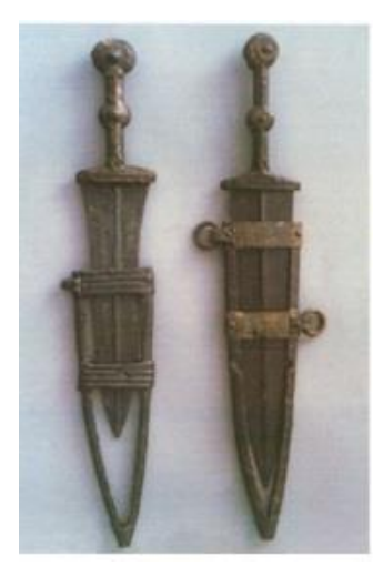
Figure 06 – Biglobular daggers found in the Celtiberian necropolis of Carratiermes (Montejo de Tiermes, Soria. 2nd century BC). In: Lorrio (2001: 196).

happened at a slower rate in this region. Thus, it is possible to observe in the Castro culture the use of torcs and weapons similar to those of the Celtiberians, even though their funeral rites (still very little known) do not follow the Celtiberian pattern of burial of ashes in urns deposited in necropolises.