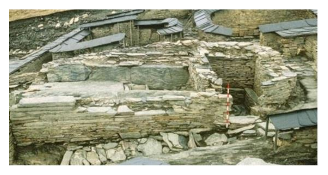
Figure 04 – Sauna of Chao Samartín. In <a href="http://www.castrosdeasturias.es/castros/62/16/la-visita-al-castro">http://www.castrosdeasturias.es/castros/62/16/la-visita-al-castro</a>

The good conservation of this bath made possible the correlation of its structure to the stone baths in the Asturian Castros of Pendia and Coaña (5<sup>th</sup> or 4<sup>th</sup> century BC), and allowed us to verify they shared similar architecture. To Villa-Valdés (2000: 97), the surprising dimensional similarity that the original plans of the buildings show demonstrate fidelity to an established pattern and the use of a same unit of measurement.