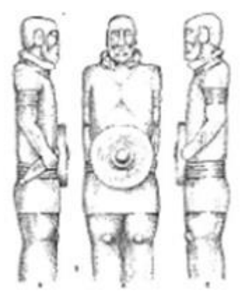
Figure 08 – Statue of Gallaecian warrior from Castro de Outeiro Lesenho wearing torc, shield, and biglobular dagger (1st century BC) In: Silva (2007: 260, Est.CXX). 12