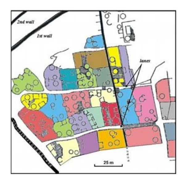
Figure 03 – Citania of Sanfins – orthogonal plan, with indication of the walls and avenues, and with the presence of round dwellings. In Parcero and Cobas, 2004: 44

century AD that – even though it has the presence of structural elements of communal organization that have as reference the family unit – was carefully planned. It had "wide streets separating regular blocks, inside which the family groups settled. These were still the fundamental unit of the settlement, even though in this case they did not superimpose the group space (the settlement as a whole)" (PARCERO and COBAS, 2004: 43).