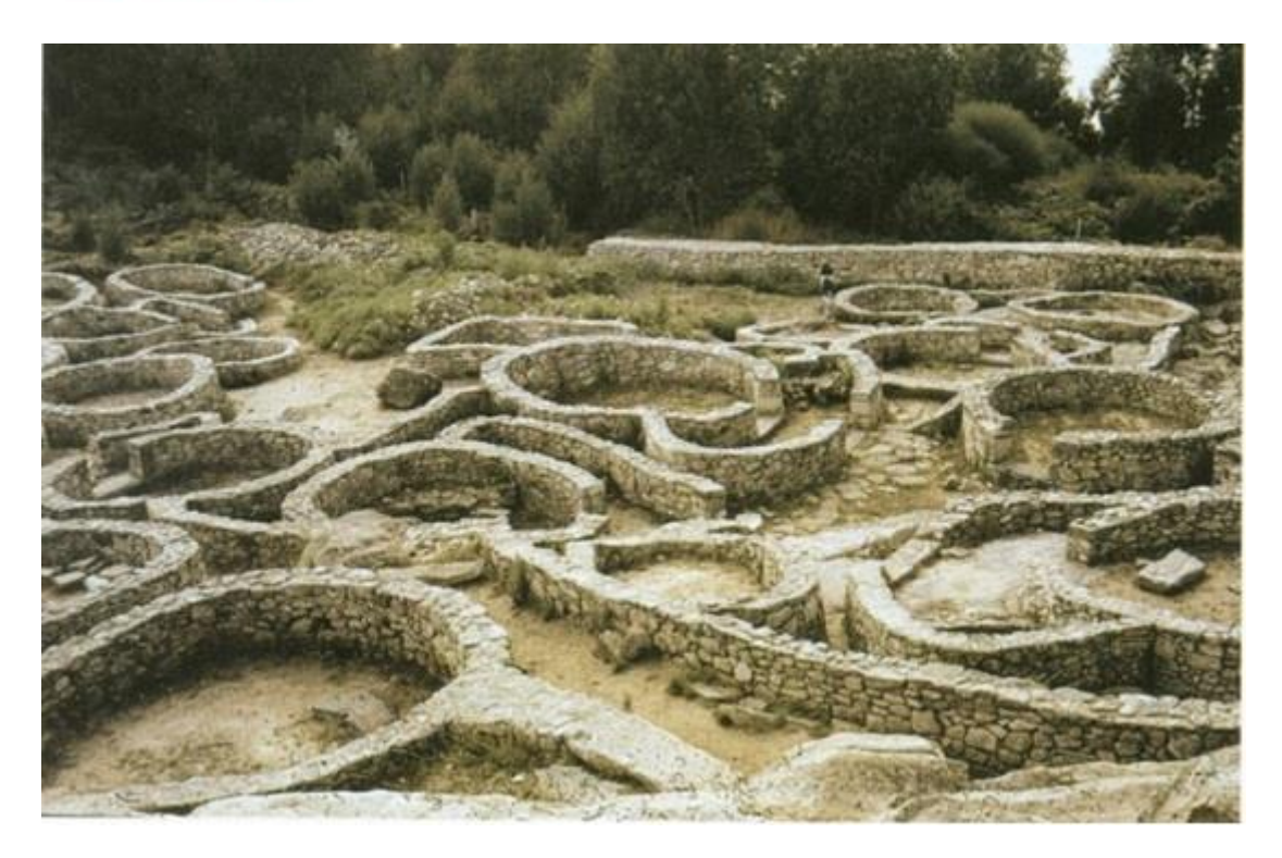
Figure 01 –Santa Tegra Castro (Guarda) with circular dwellings inside a plane that does not follow the orthogonal pattern. In: Bravo (2001: 130).