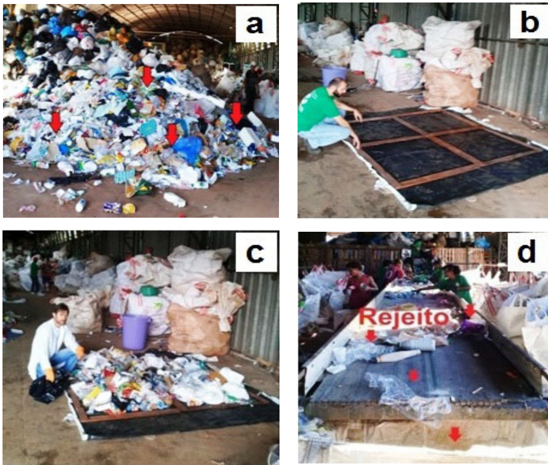
Figure 1. Images of the site where the gravimetric characterization was performed at COOPECO Cooperative, Bauru-SP.

(a) General overview of the cooperative yard with arrows pointing to the locations where samples were collected. (b) Assembly of the 2x2m wooden quadrant on a tarpaulin. (c) Homogenization and quartering of materials for gravimetric analysis. (d) Horizontal conveyor where the materials are sorted where arrows point to the direction and accommodation of the residues in the bag.