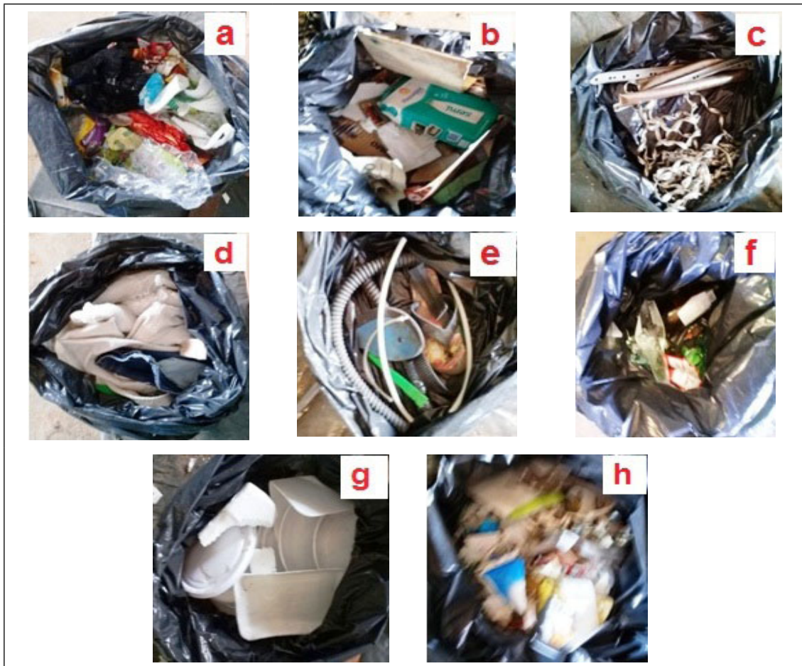
Figure 3. illustrates some of the fractions of dry recyclables and components evaluated in this work. (a) “plastic” fraction, (b) “paper” fraction, (c) “metal” fraction, (d) fabric “fraction”, (e) “rubber” fraction, (f) “glass” fraction, (g) “styrofoam” fraction and (h) “others” fraction.

The collection locations according to the day of the week with the total weight, that is, each test carried out on the dry waste on the arrival resulting from portions of waste from a particular neighborhood or location, transported by a cage truck and unloaded in the entrance yard of the cooperative are listed below.