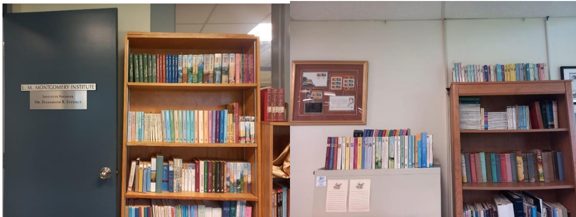
Photographs 4 and 5 – The L. M. Montgomery Institute office, housed in the Robertson Library of the University of Prince Edward Island.