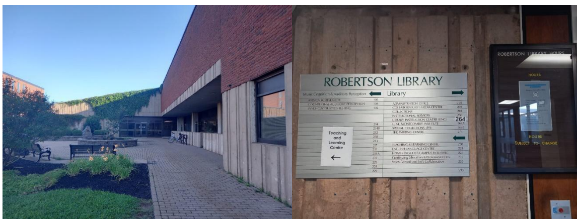
Photographs 8 and 9 – Front of the building of the Robertson Library and its sign with information about the library hours and its sections (including the L. M. Montgomery Institute).

Following are images depicting the Robertson Library of the University of Prince Edward Island: